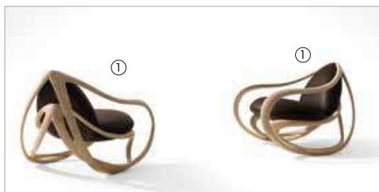
1 Move 69810 leather 9122 fin.96