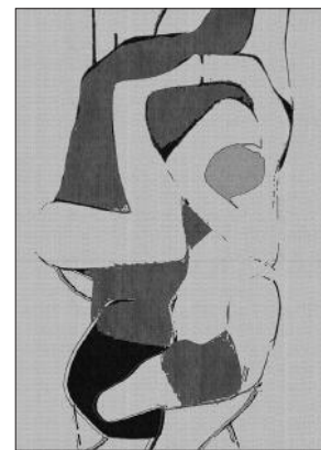
GA068 Arazzo in lino e seta Tapestry in linen and silk cm 340 x 240 in 133 7/8 x 94 4/8