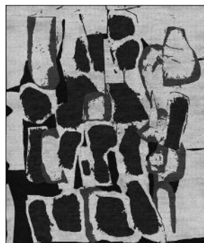
GA066 Arazzo in lino e seta Tapestry in linen and silk cm 240 x 200 in 94 4/8 x 78 6/8