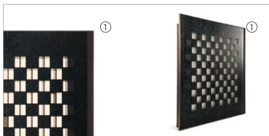
1 The Cabinet of Memories 12018

12012 Kit 12 rivestimenti in raso di seta Kit 12 inserts in satin