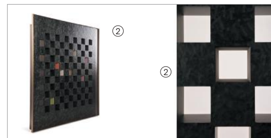
2 The Cabinet of Memories 12018+12012