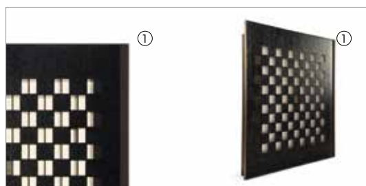
1 The Cabinet of Memories 12018