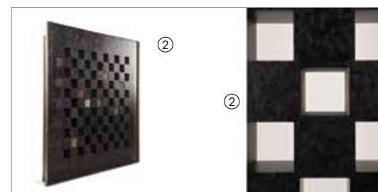
2 The Cabinet of Memories 12018+12012