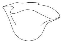
GA251 Vaso ametista/foglia oro Vase amethyst/golden leaf cm 60 x h 35 in 23 2/4 x h 13 3/4

Mould-blown glass vase with an irregular shape, characterised by a traditional Venetian decoration realised with a golden or silver leaf that, with blowing, fragments within the glass. It is available in three colours: amethyst/golden leaf, satinized milk/silver leaf and steel/silver leaf.